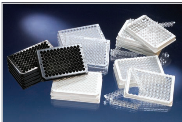
Thermo Scientific Nunc Immobilizer Streptavidin and Nunc Immobilizer Amino surfaces.

commonly used acceleration factor, temperature has a strong relationship with the Arrhenius equation,